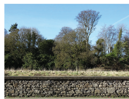
Existing wall to be retained. Where breaks occur, pillars to match existing details to be constructed and made good