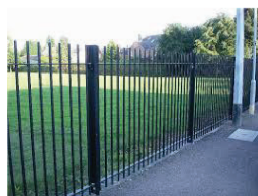
Proposed 1.8m high vertical bar railing (black)