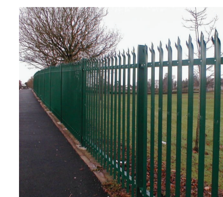
Temporary palisade security fence