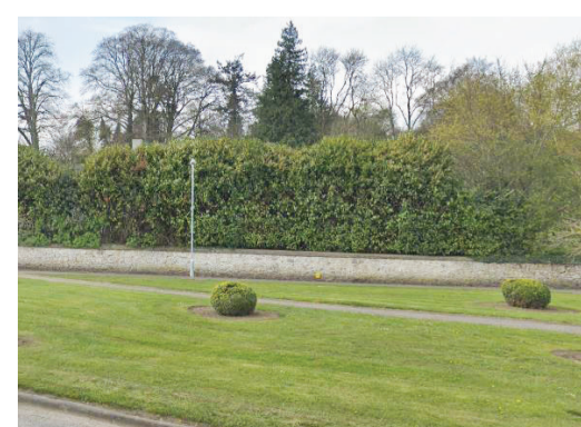
Existing hedge to be retained

DATE: October 2019 SCALE: VARIOUS @A1 DRAWN: TC/DC/AM CHECKED: EO DRAWING NO.: 18221-2-105