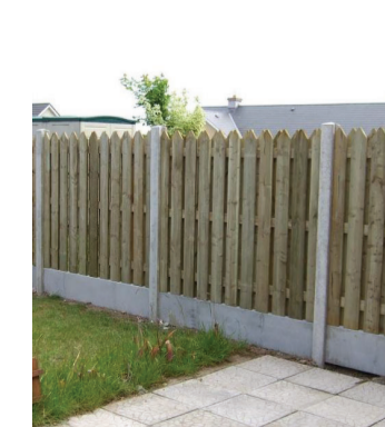
Proposed 1.8m high concrete post and plinth fence