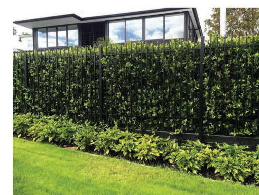
Proposed 1.8m high vertical bar railing (black) and adjacent planting as appropriate