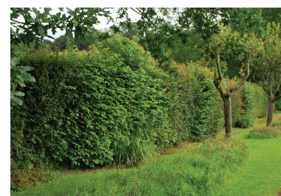
Proposed high mixed native hedgerow