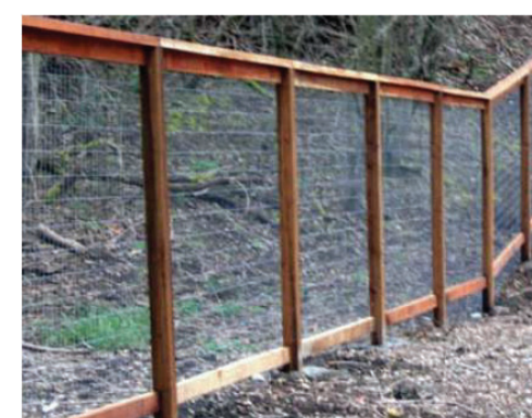
Proposed 1.8m high post and wire fence with adjacent planting