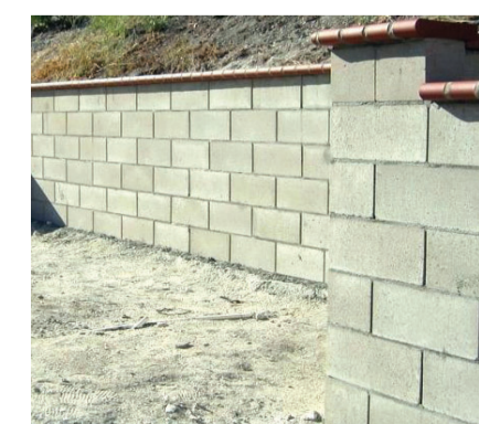
1800 mm high capped block wall